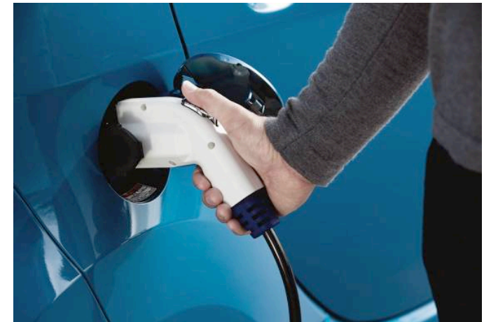
Figure 1. Option A assumes that by 2050, 100% of domestic vehicles be electric. © Peugeot

Selecting any of Option A to D does not impact on the other technologies included in the 'Shift to zero emissions transport' slider which includes buses, trains and domestic aviation.